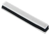
FTR EPM1 55% (F7) 418X44X21 Code 21626