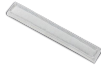
FTR ISO COARSE 90% (G4) 420X59X5 Code 21629