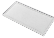
FTR ISO COARSE 90% (G4) 400X200X5 Code 21628