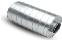
NA 160 PHI Code 21643