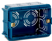
SCI503 Code 22461