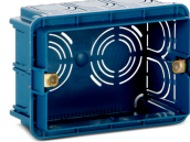
SCI503 Code 22461