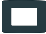
PSC-B Code 22463