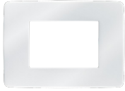
PSC-W Code 22462