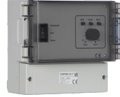
VORT DELTA T Code 13039