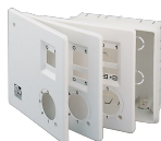
KIT SCB (TRASF.E.C.)