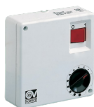
C 2.5 (COMANDO EL. 2.5 A)