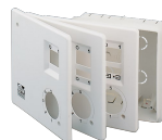
KIT SCB5 (TRASF.5 V.)