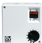
SCNR5 UNIF.X NK SOFFITTO