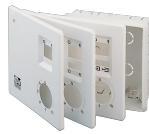
KIT SCB (TRASF.E.C.)