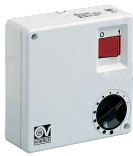
C 1.5 (COMANDO EL. 1.5 A)