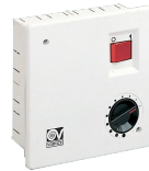
SCNRB SCAT.COM.NON REV.INCASSO