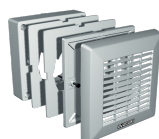
F 150/6" Code 22133