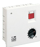
SCNRB SCAT.COM.NON REV.INCASSO Code 12971