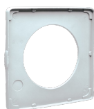
S 150/6 Code 22156