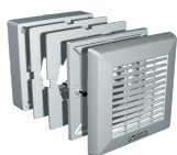
F 120/5" Code 22132