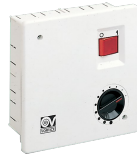
SCNRB SCAT.COM.NON REV.INCASSO