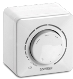
POT Code 12828