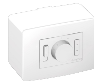
POT-IT Code 12826