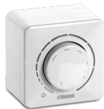
POT Code 12828