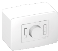
POT-IT Code 12826