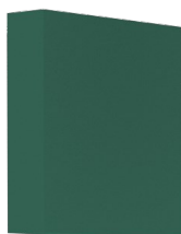
2FTR-ISO COARSE 65% (G4) 287X592X24 Code 13041