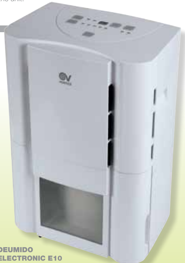
DEUMIDO ELECTRONIC E10 Code 26010