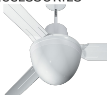
EVOLUTION LIGHT KIT Code 22413