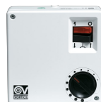
SCRR5 Code 12963