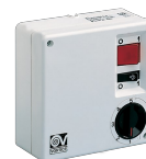
SCRR5L Code 12964