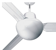
EVOLUTION LIGHT KIT ES Code 22414