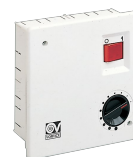
SCNRB SCAT.COM.NON REV.INCASSO Code 12971