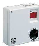
C 1.5 (COMANDO EL. 1.5 A) Code 12966