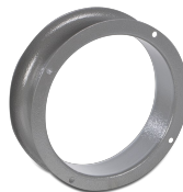
TR-B 10/15 (BOCCAGLIO ASPIRAZIONE) Code 22600