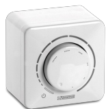
POT Code 12828