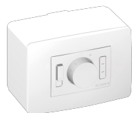
POT-IT Code 12826